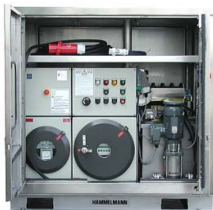
Ex-proof Zone 1 control cabinet